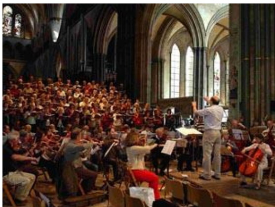
David Halls conducting rehearsals of the Salisbury Vespers at Salisbury Cathedral. DB5965P01

Foot-tapping rhythms contrasted with periods of quiet